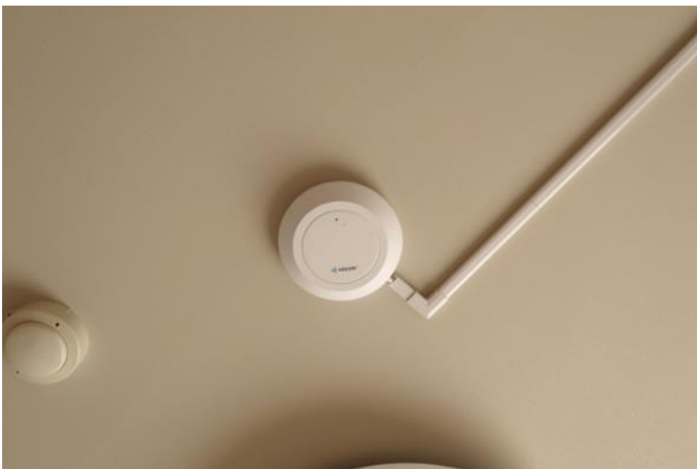
Pictures: The fall detection sensor placed on the ceiling for the verification at nursing facilities